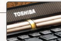
Centralized Power Button