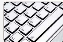
Tiled-style, Full Size Keyboard