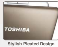
Stylish Pleated Design

Toshiba recommends Windows® for everyday computing